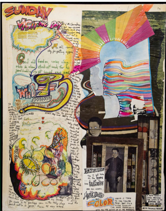
Ken Kesey, Jailhouse Journal