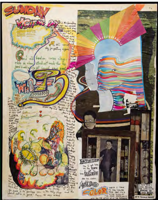
Ken Kesey, Jailhouse Journal